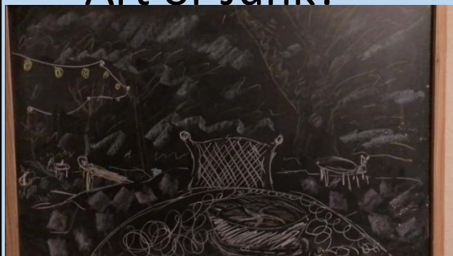
Chalk on blackboard. A recollected image of Caffe Driade