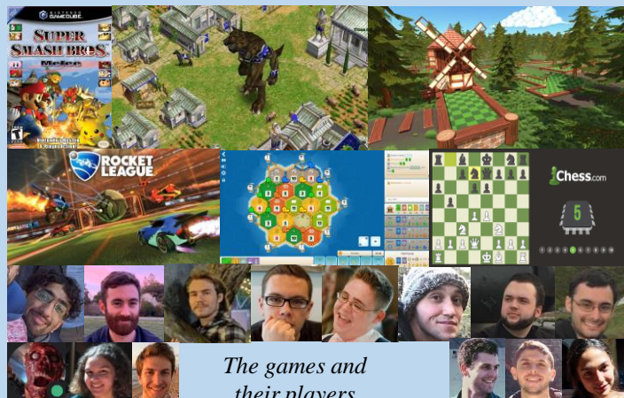
The games and their players