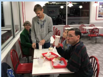
The wonders of In-N-Out

After biking around for a few days, we headed to a Lake Tahoe cabin for some R&R!