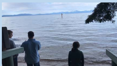
Views from Lake Tahoe