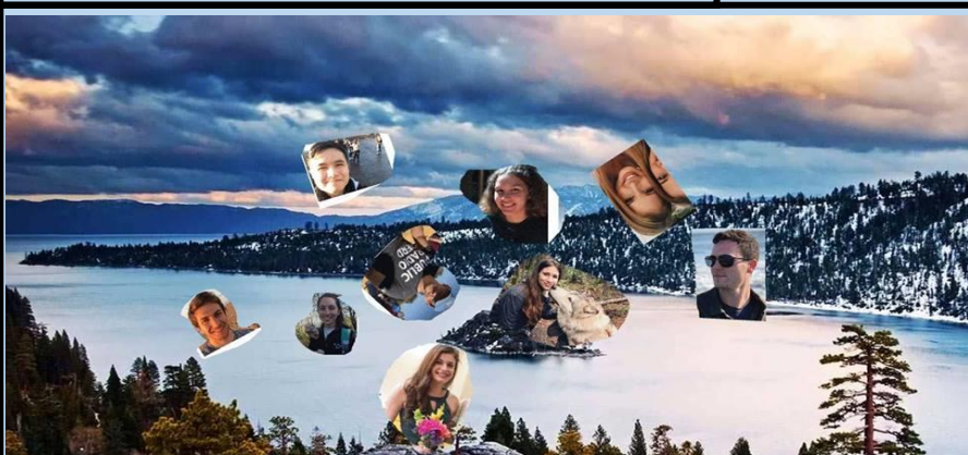
The Tahoe! Facebook event photo (unadulterated)