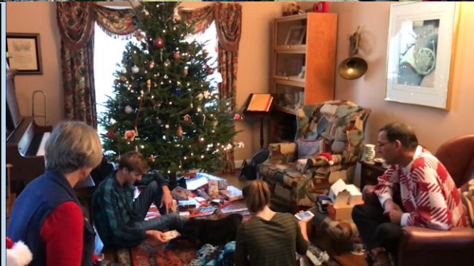
Top-left: A beach in Ft. Lauderdale. Top-right: Mayan Ruins in Costa Maya. Bottom: Christmas at home.

This is one of my last quarters of "real" classes—what comes next??